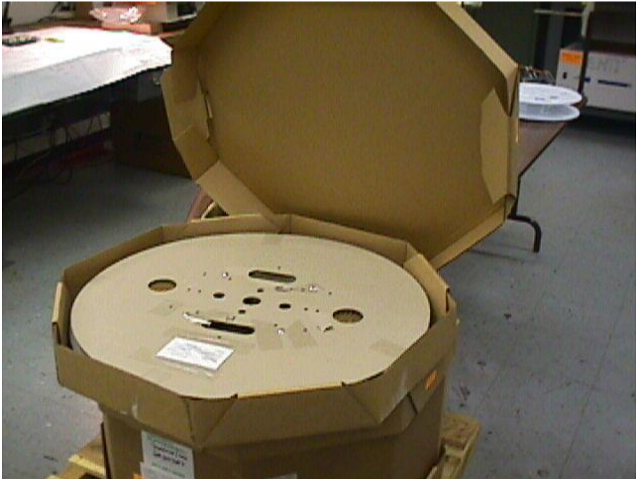
Figure 4 Tabs packaged horizontally

Parts that are classified as direct ship to Autossplice Customers must conform to WI-4.6-11. Permanent supplier identification/markings is not permitted anywhere on internal or external packaging. Supplier identification on external removable documents that are shipped to Autossplice is permitted with prior written approval.