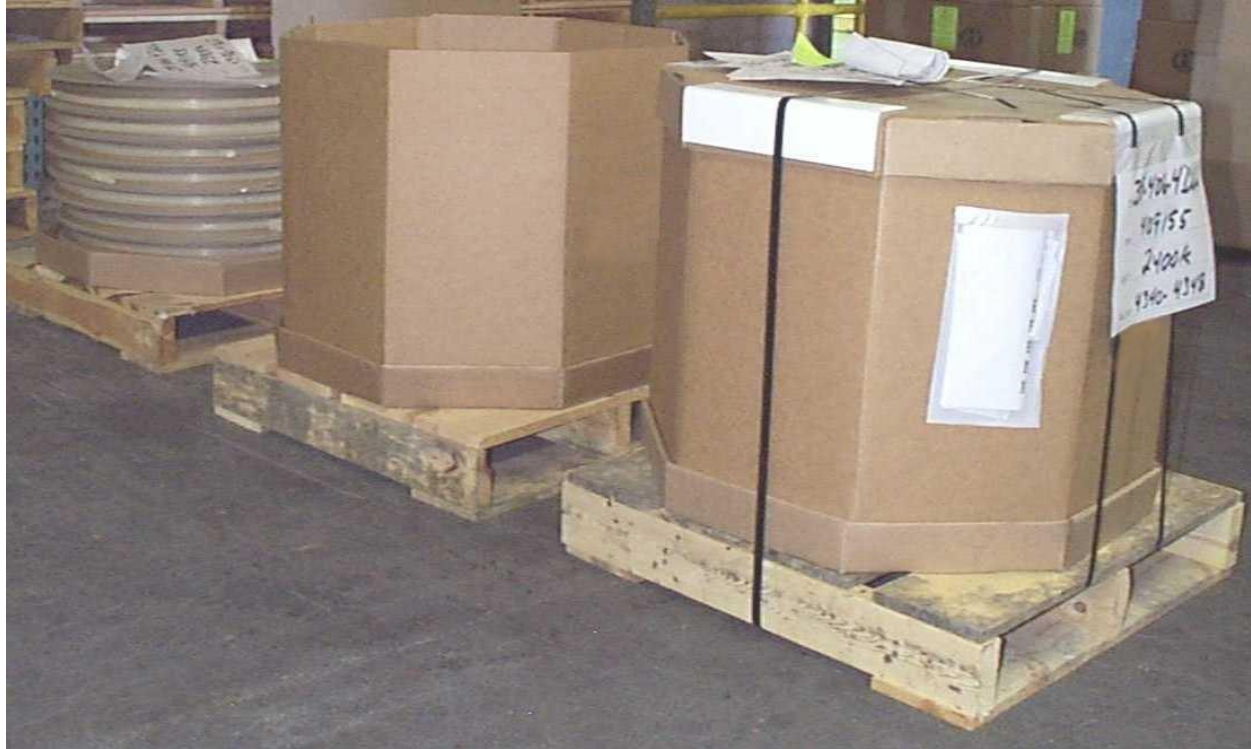
Figure 3 Packages shipped on skids

DOCUMENT OWNER TITLE: SR. DEVELOPMENT ENGINEER