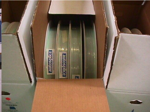
Figure 2 Pin reels in box stacked vertically