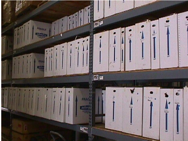
Figure 1 Pin boxes stacked vertically

DOCUMENT OWNER TITLE: SR. DEVELOPMENT ENGINEER