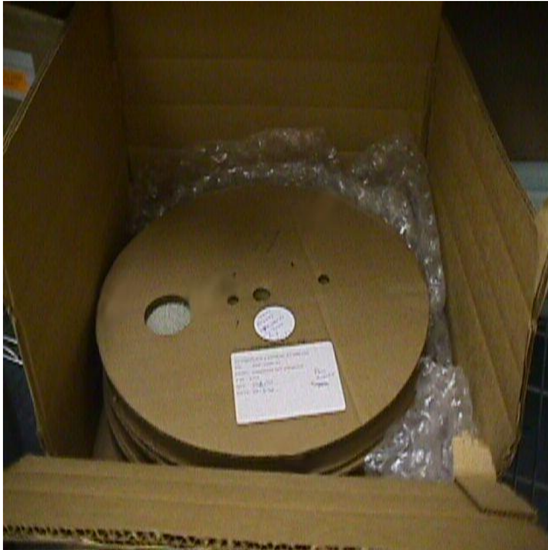
Figure 5 Tabs packaged with bubble pack for cushion

DOCUMENT OWNER TITLE: SR. DEVELOPMENT ENGINEER